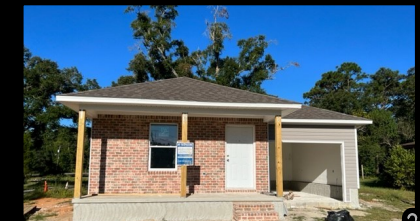
For Sale 607 Rentz Avenue