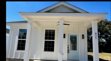
For Sale 825 North C Street

Escambia County Housing Finance Authority