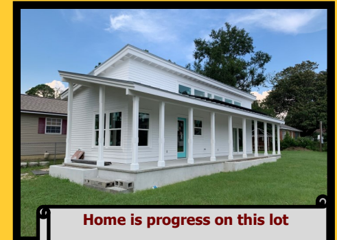
Home is progress on this lot 2300 North Tarragona Street

Participating Lenders will provide specific APR information as required by law. Mortgage Rate/APR and DPA Amount may be reset periodically based on market conditions. The Issuer reserves the right to modify terms of the Program at any time.