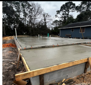
Under Construction 1038 Bremen Avenue

700 South Palafox Street, Suite 310 Pensacola, FL 32502