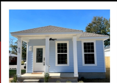
For Sale 815 North C Street