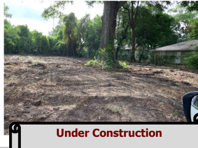
Under Construction 8401 Pittman Avenue