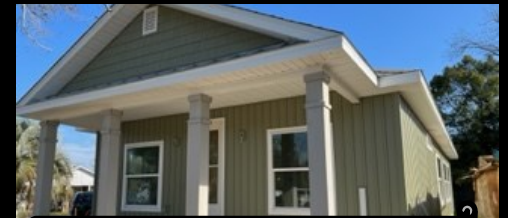
Under Construction 1100 Hayden Court