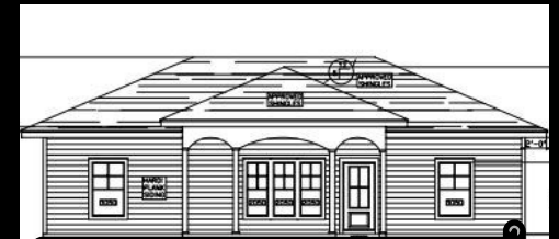
COMING SOON! 707 East Scott Street