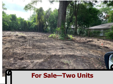
For Sale—Two Units 1908 North Tarragona St.