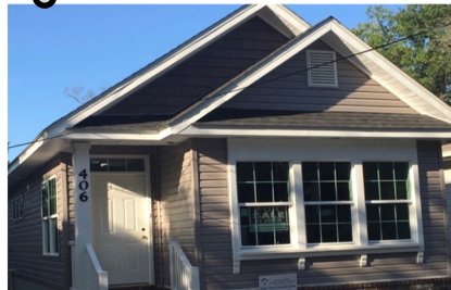
COMING SOON! 100 BLOCK EAST JORDAN STREET

700 South Palafox Street, Suite 310 Pensacola, FL 32502