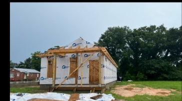
Under Construction 825 North C Street

Escambia County Housing Finance Authority