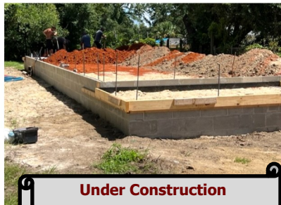
Under Construction 1114 West Brainerd Street